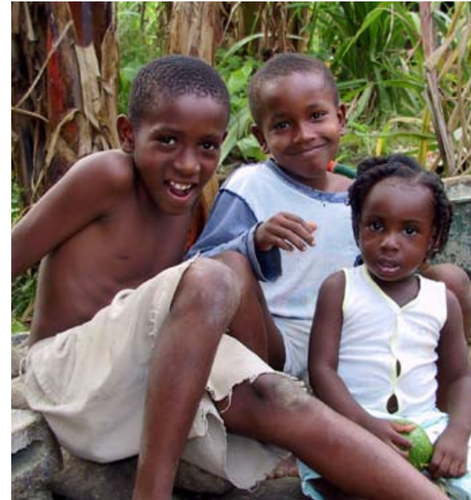
Could you provide a family for a child who needs one? Contact us!